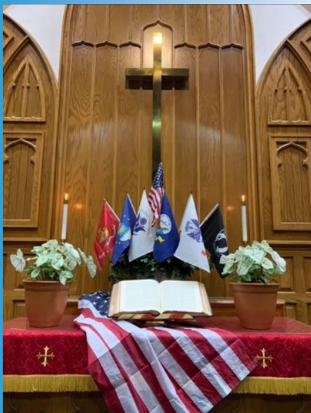
Fourth of July Sunday altar flowers given by the Worship Committee to the glory of God and in honor of the American men & women who have served or are serving in our military.