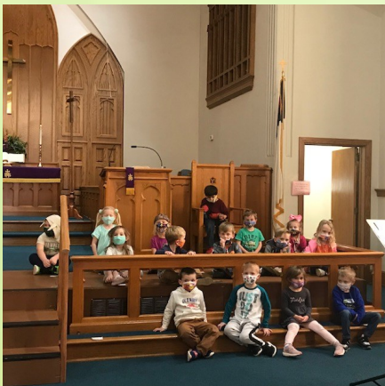
Our Preschooler's enjoyed singing songs at the Lenten