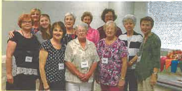
The Uwharrie District ladies collected School Supply Kits and Teenage Personal Hygiene items.